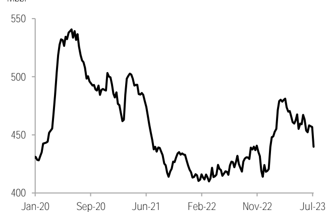
US crude-oil inventories (excluding SPR)

Source: Banorte with data from EIA *SPR: Strategic Petroleum Reserve